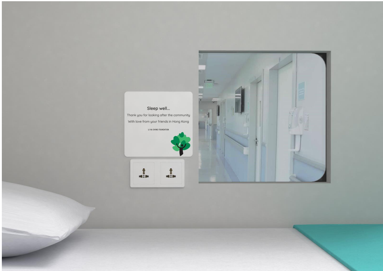
Detail of the interior design of the pods.