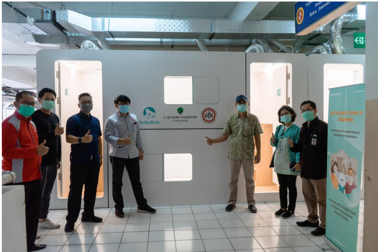
Handover of pods donated by Bobobox and Li Ka Shing Foundation at Hasan Sadikin Hospital, Bandung.

Bandung, 10 April 2020 — Bandung-based accommodation startup company, Bobobox, donates 100 sleeping pods for hospitals mandated to handle COVID-19 cases in Jakarta and West Java. The pods are intended for medical workers to take rest in between their long shifts.